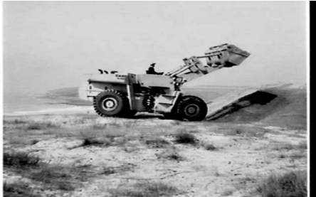
The old clubhouse shows the extent of sand dune erosion but heavy machinery begins to restore the dunes.