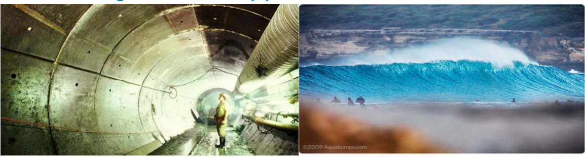
Photos: The underwater sewage pipeline ready to take sewage from Malabar headland out to sea.

The giant underwater pipeline to a cleaner, safer beach